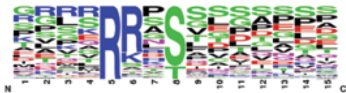
The Motif Logo shows the amino acid distributions around the sites recognized by the antibody.

Applications Key: W—Western IP—Immunoprecipitation IHC—Immunohistochemistry ChIP—Chromatin Immunoprecipitation IF—Immunofluorescence F—Flow cytometry E-P—ELISA-Peptide Species Cross-Reactivity Key: H—human M—mouse R—rat Hm—hamster Mk—monkey Mi—mink C—chicken Dm—D. melanogaster X—Xenopus Z—zebrafish B—bovine Dg—dog Pg—pig Sc—S. cerevisiae Ce—C. elegans Hr—horse All—all species expected Species enclosed in parentheses are predicted to react based on 100% homology.